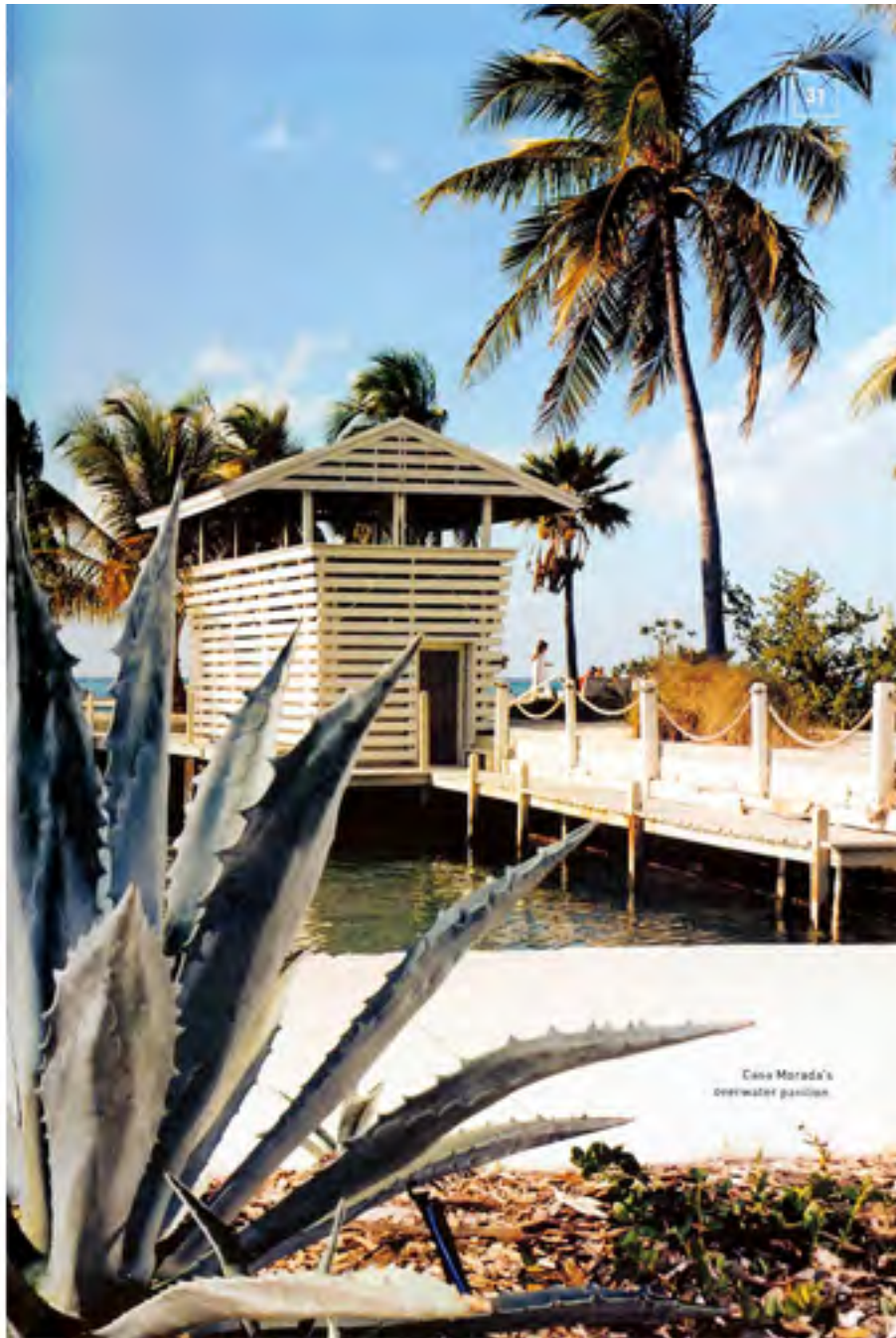
Casa Morada's overwater pavilion

136 MADEIRA ROAD, ISLAMORADA, FLORIDA 33036 • VOICE 305.664.0044 • FAX 305.664.0674 WWW.CASAMORADA.COM E-MAIL: INFO@CASAMORADA.COM