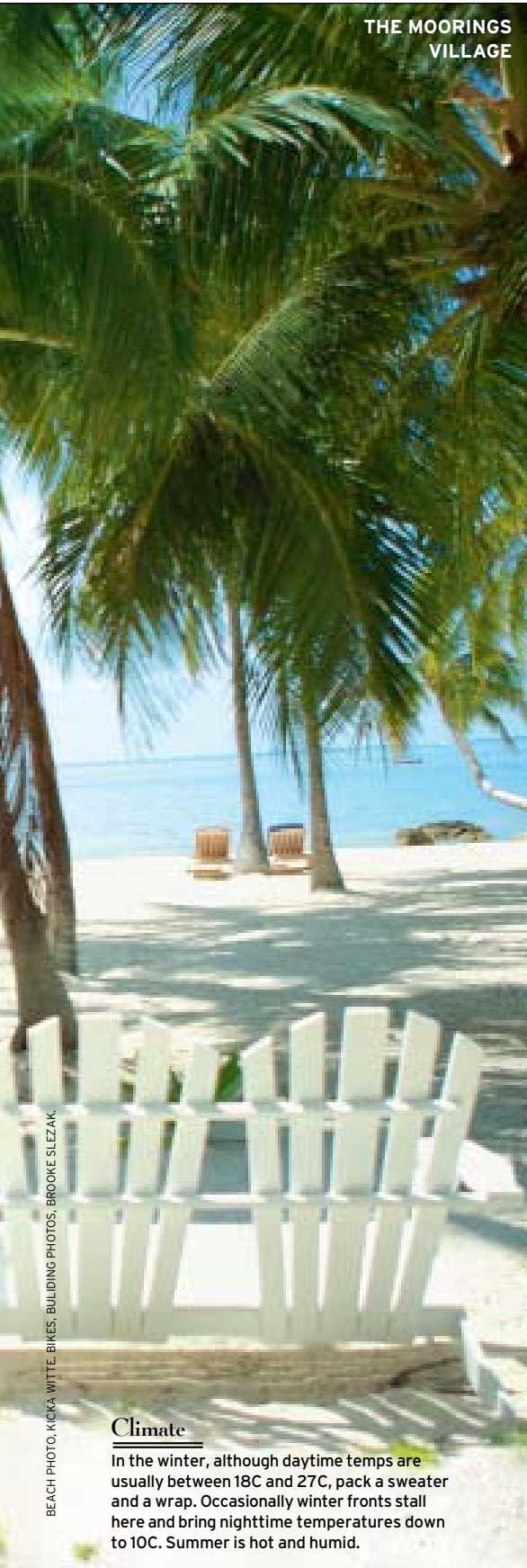
THE MOORINGS VILLAGE